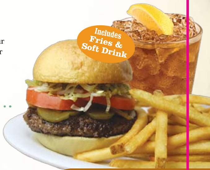
NEW TURKEY BACON BRIOCHE