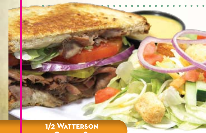
1/2 WATTERSON AND GARDEN SALAD

*CONSUMING RAW OR UNDERCOOKED MEATS, POULTRY, SEAFOOD, SHELLFISH, OR EGGS MAY INCREASE YOUR RISK OF FOODBORNE ILLNESS, ESPECIALLY IF YOU HAVE CERTAIN MEDICAL CONDITIONS.